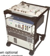
Shown optional twin-wheel casters