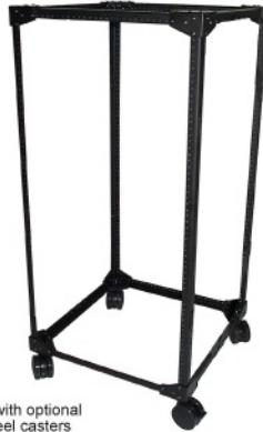
Shown with optional twin-wheel casters