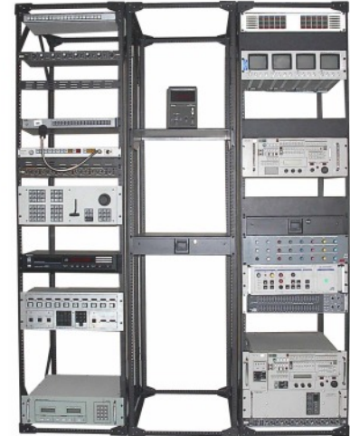
Shown with optional cross braces