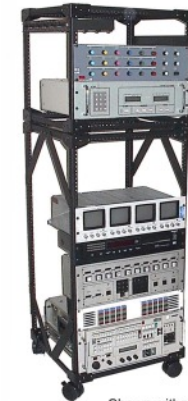
Shown without optional twin-wheel casters and cross braces